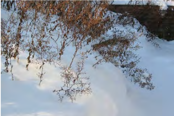
The shade garden where heart-leaved aster, zigzag goldenrod, white snakeroot, bottlebrush grass and blue-stemmed goldenrod stand out in the snow.

bring them inside to dry on flat trays for about a week. Then I store them, each species in its own carefully labelled envelope, ready to share or plant. I plant the seeds I harvest from my own garden before the soil freezes, usually around the end of October. I sprinkle them either in pots or directly on the soil in a prepared area in my garden. Squirrels like to dig in unprotected pots of seeds left on my patio so I use garden netting to cover whole flats of seeds. For individual larger pots, the plastic net bags that onions and oranges are packaged in at the supermarket make excellent protective covers: they just slip over the pot like a sleeve.