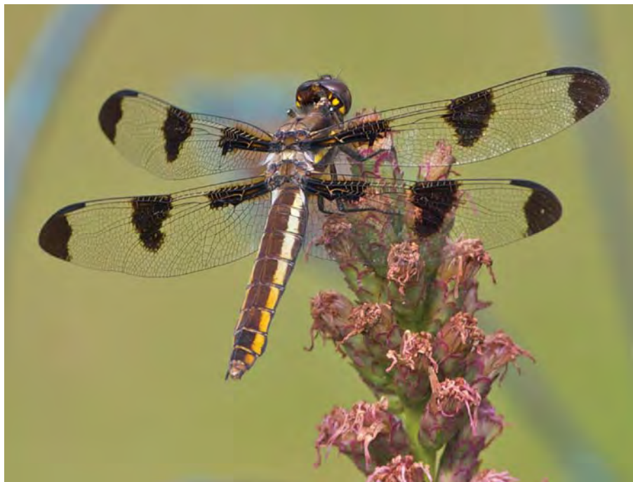
Twelve-spotted skimmer on blazing star (Liatris sp.)