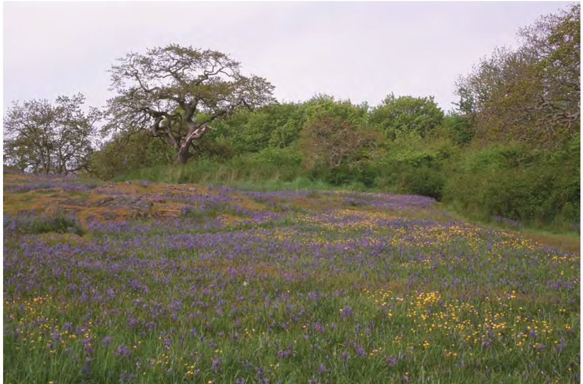
A Garry oak meadow

800 insects and mites have been identified in B.C.'s GOEs. Rarities include the sharp-tailed snake and vesper sparrow. When GOERT began its work, 61 plants (59 vascular plants and two mosses) were listed as Species