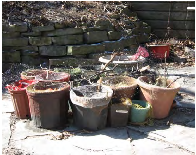
Vivienne's seed nursery pots get a little sun in early March

In a city garden, other less desirable surprises pop up. I am surrounded by gardens filled with cultivars of the native strains I am carefully cultivating in my garden; some cross-pollination naturally occurs. American columbine ( Aquilegia canadensis ) will not seed true if cross-pollinated with European columbine ( Aquilegia spp.) cultivars. Unfortunately, there are gardens in my immediate neighbourhood with cultivated columbines. I weed out any of my columbines that do not have the native yellow and reddish-orange flower so my plants look true to form, but they may be hiding some European genes. For that reason, I do not send my columbines to the seed exchange or give them to friends. I have suspicions about my black-eyed Susans ( Rudbeckia hirta ) as there are several neighbourhood gardens with plants that look like the cultivars. I suspect there are other natives which