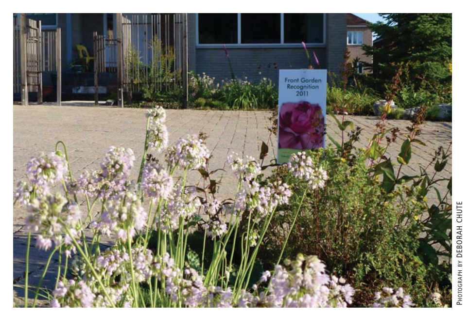
Allium cernuum, Penstemon digitalis and Potentilla fruticosa (shrubby cinquefoil) in the foreground. At the back, spikes of pink Liatris spicata with Spirea alba behind the gate.

bees on the harebells, two-spotted bumble bees on purple-flowering raspberry ( Rubus odoratus ) and smooth rose ( Rosa blanda ), big blackbodied carpenter bees on wild bergamot ( Monarda fistulosa ) and obedient plant ( Physostegia virginiana), and smaller sweat bees on meadowsweet ( Spirea alba ) and tall cinquefoil ( Potentilla arguta ), to name just a few!