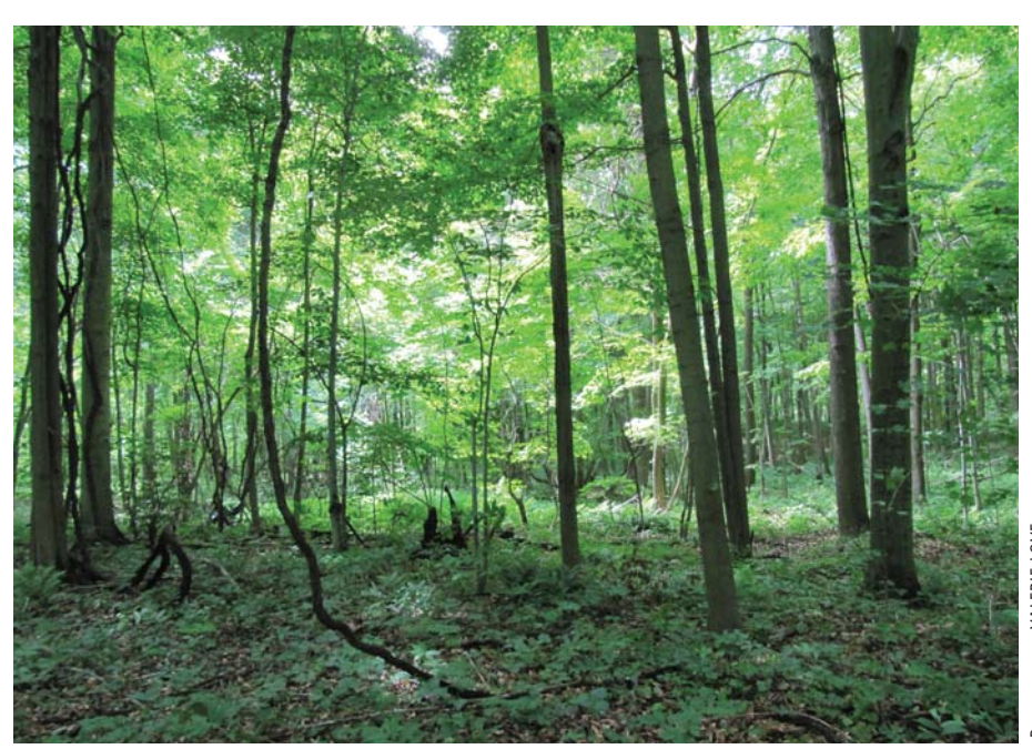
Shining Tree Woods

Deborah Dale helps to coordinate NANPS conservation activities at Shining Tree Woods.