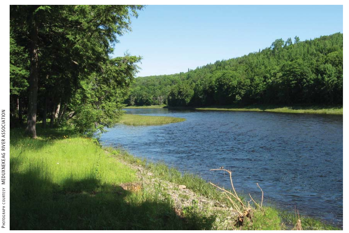
McCurdy Flats has recently joined the Meduxnekeag Valley Nature Preserve.

How does a small local organization finance large purchases? The Meduxnekeag River Association draws inspiration, in part, from the ecological diversity of the rich hardwood forest sites it purchases and protects; diversity is key to its