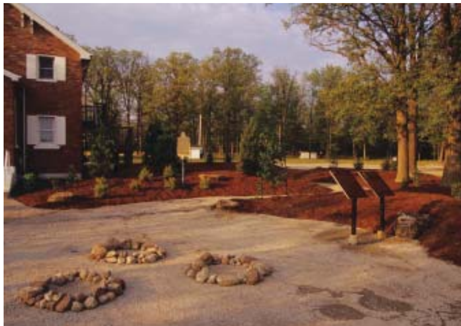
The new Old Council House garden beds (before shrubs and perennial plantings) and gathering area with the Three Fires in the foreground. The grove is in the background.

logging increased, waters became over-fished and game over-hunted. Furthermore, the notion of private property rights prevented their historical patterns of travel. Consequently, the Mississaugas adopted a less nomadic lifestyle eventually settling in 1847 at the present-day Reserve at Hagersville.