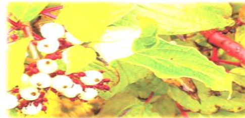
Red Osier Dogwood