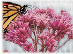
Joe Pye Weed

Swamp rose ( Rosa palustris ) Pink five-petalled flowers in early summer. Rosehips eaten by birds and other wildlife. One metre to two metres high.